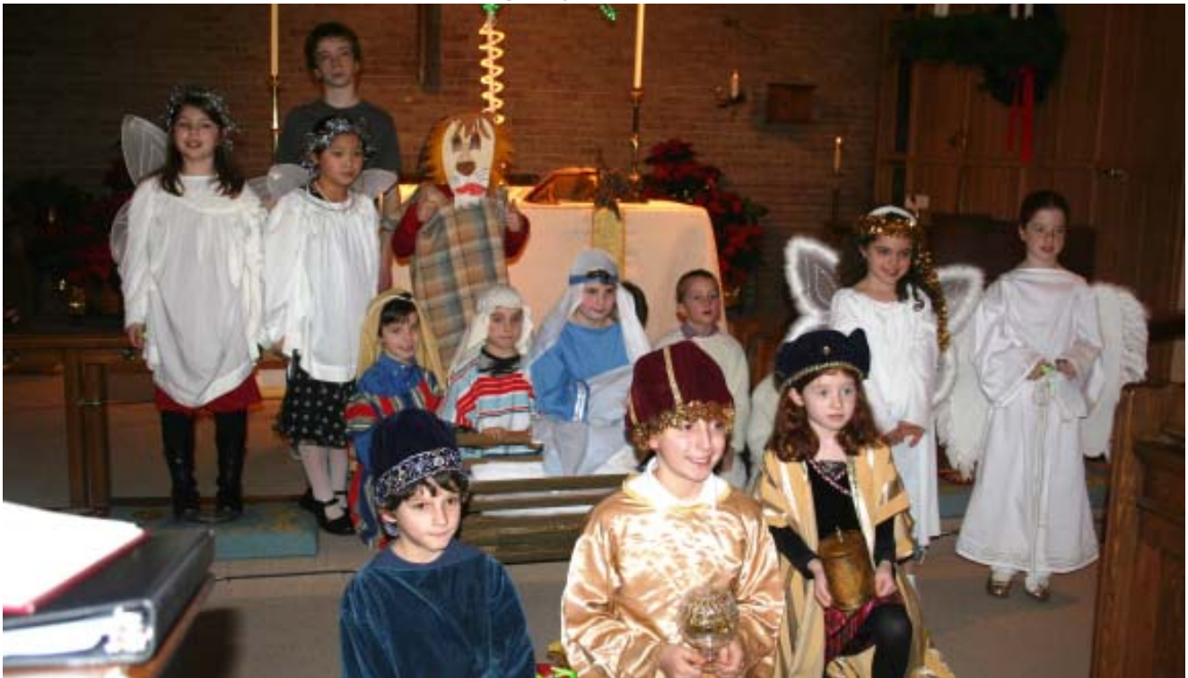
The Pageant Players:

While shepherds watched their flocks by night, All seated on the ground, The angel of the Lord came down, And glory shone around.